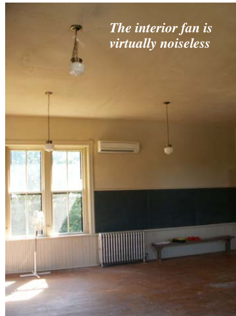
The interior fan is virtually noiseless