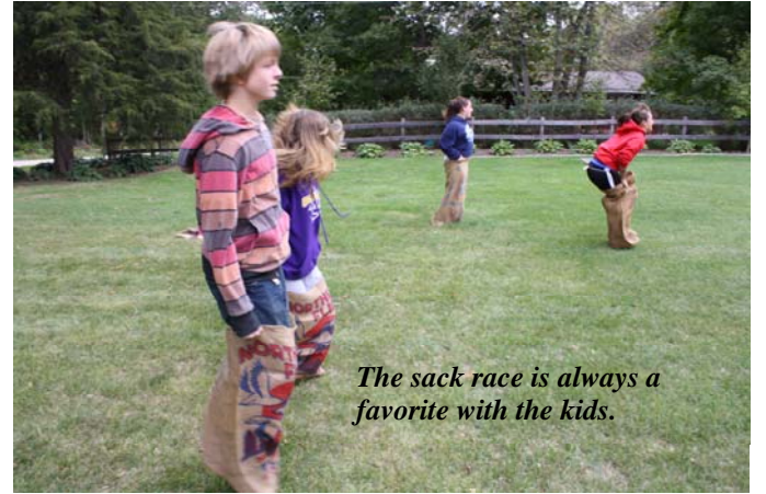
The sack race is always a favorite with the kids.

Great weather blessed the seventh annual September 25 Jane Addams Festival which included a 5K run and walk on the Jane Addams Trail, games and food at the Cedarville Museum and free tours of the museum.