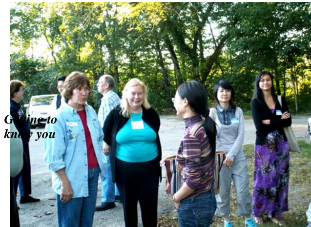
Getting to know you