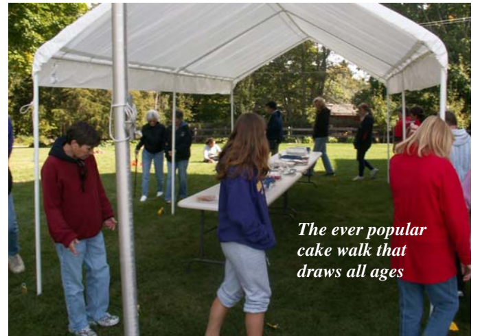
The ever popular cake walk that draws all ages