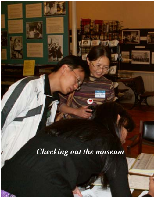
Checking out the museum