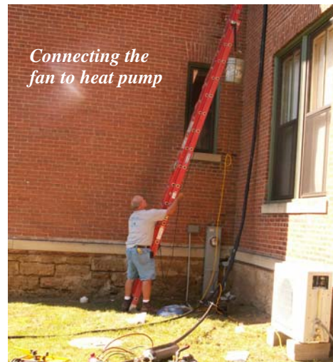
Connecting the fan to heat pump

Lemanski Heating and Cooling, Freeport, has completed installation of a heating and cooling system in the museum's second floor north room. The room will be used for programs freeing the first floor south room for exhibits. The system utilizes an outdoor heat pump and a single quiet wall mounted fan inside. The system can be easily expanded if needed.