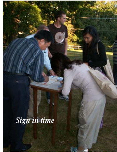
Sign in time