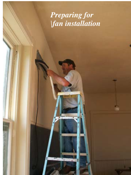
Preparing for fan installation