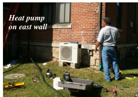
Heat pump on east wall