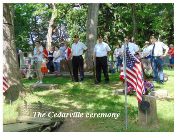
The Cedarville ceremony