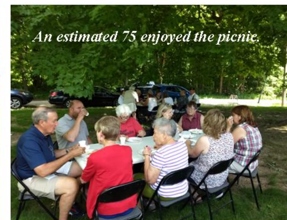
An estimated 75 enjoyed the picnic.