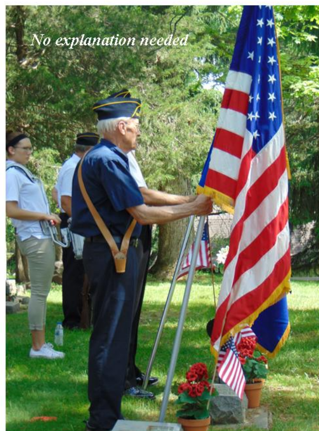
No explanation needed