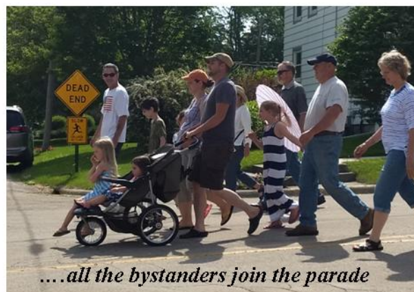
....all the bystanders join the parade