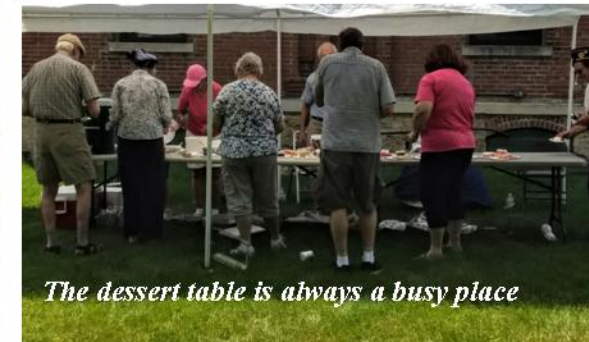
The dessert table is always a busy place