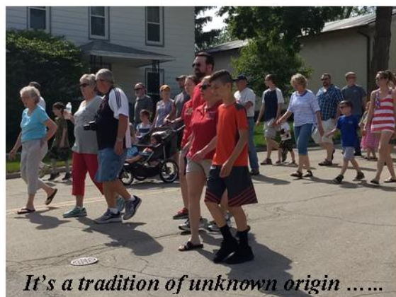
It's a tradition of unknown origin .....