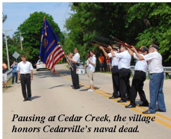
Pausing at Cedar Creek, the village honors Cedarville's naval dead.