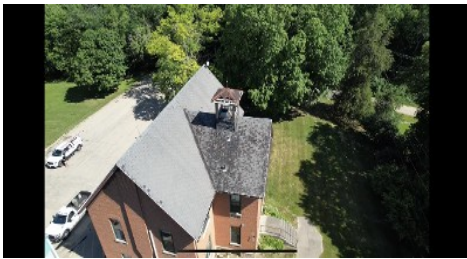
View of roof in June. Wood under shingles was found to be rotted. The Cupola or Bell Towers damage would have to be determined once the workers started the actual work on the roof