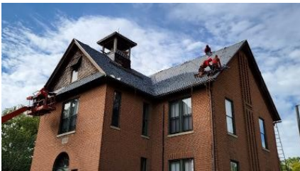
By Tuesday am, sheeting and most of the synthetic felt paper on the west side was done. South east section still had the old shingles on it. End of day saw that all shingles were removed. Please note the very hard working workers: You certainly cannot be afraid of heights