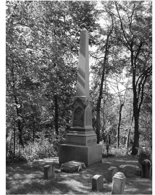
Cluster of monuments related to the Addams family in Cedarville Cemetery.