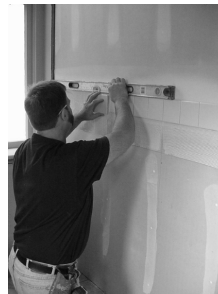
Construction of handicapped accessible bathrooms in the 1889 Cedarville school is expected to be completed by August 31, a major step toward turning the building into a local museum. Above, tile setter from Floor to Ceiling, Freeport, adjusts top row of ceramic tile in men's bathroom. More photos on pages 4 and 5. Final list of contributors on pages 6 and 7.