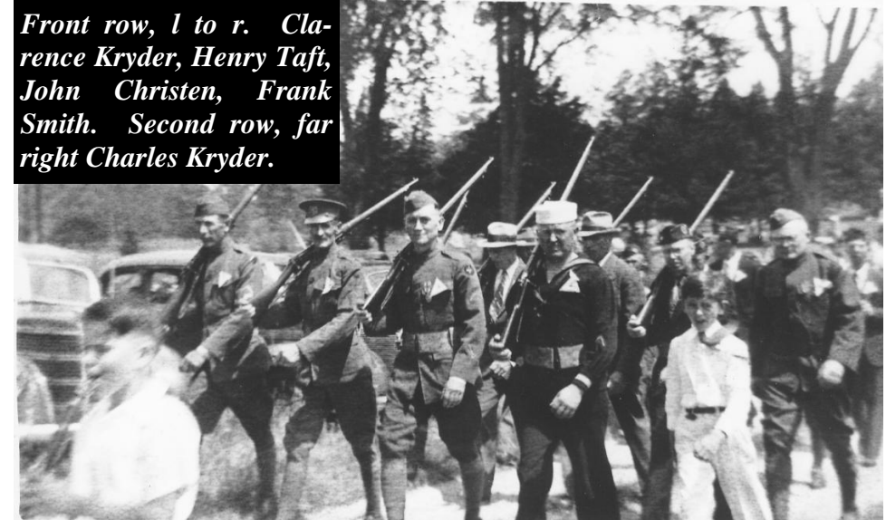
Memorial Day parade just before WWII