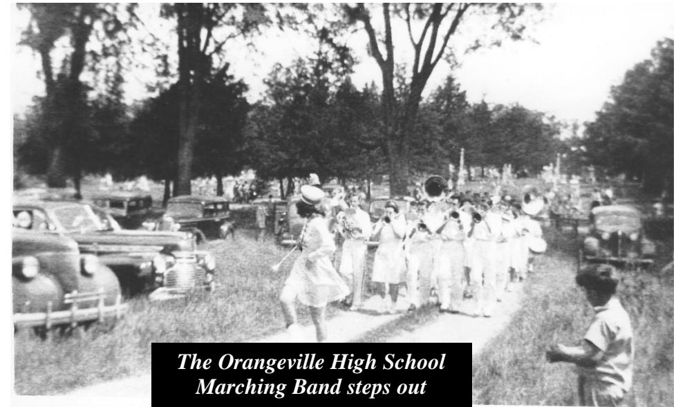
The Orangeville High School Marching Band steps out