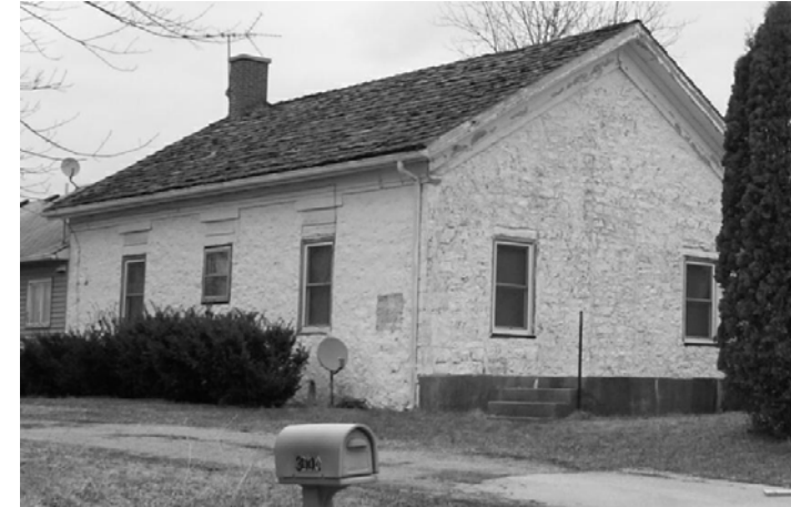
Buena Vista School at the intersection of Red Oak Road and McConnell Road as part of a residence in April 2009.

The historical society is recognized as a non-profit organization by Illinois and the U. S. government and as such has been designated as eligible to receive tax deductible gifts under the IRS tax code regulation 501 ( c ) ( 3 ).