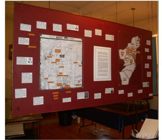
Where did the earliest Cedarville area pioneers come from? This exhibit researched by Ladona Wardlow answers the question.