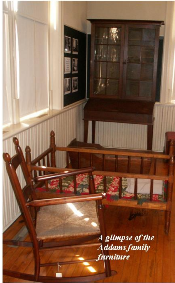
A glimpse of the Addams family furniture