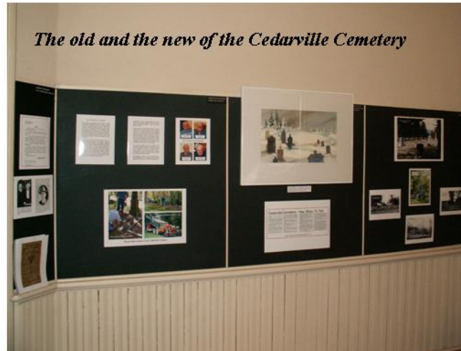
The old and the new of the Cedarville Cemetery