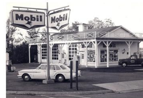
A new station was constructed at the site in the 1960s.

Area as traffic increased following the construction of Highway 26 in 1928 (formerly known as Highway 74). The self-service station was still in its infancy and operators of the three stations were full service operators who checked oil and air and cleaned windshields. Some of the names I recall are Bender, Koppein's, Harold and Robert Fink, Leonard