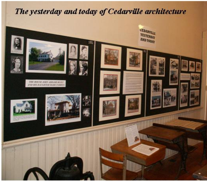
The yesterday and today of Cedarville architecture