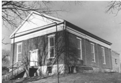
The building on Cedar Street when it was no longer a church