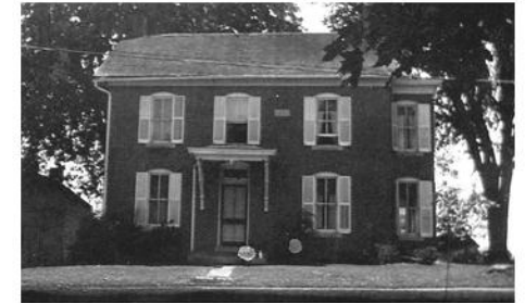
The 1888 Benson house today