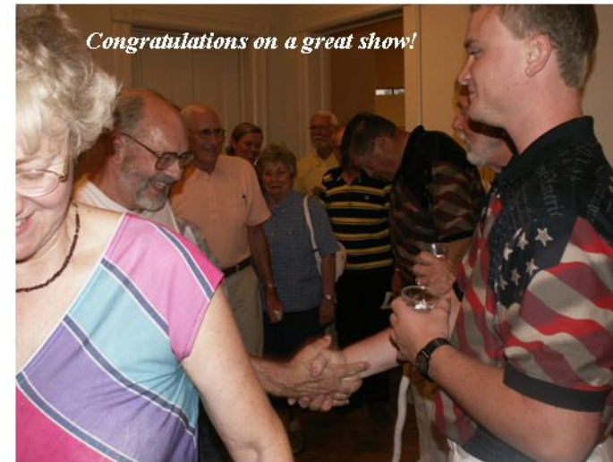
Congratulations on a great show!

Another full house greeted the barbershop quartet "Cadence" when it performed in the Cedarville Museum July 24. The music didn't stop after the scheduled program. As the audience spilled into the research center for refreshments, the quartet delighted the eaters with more than a half dozen familiar melodies that were not included earlier in the night.