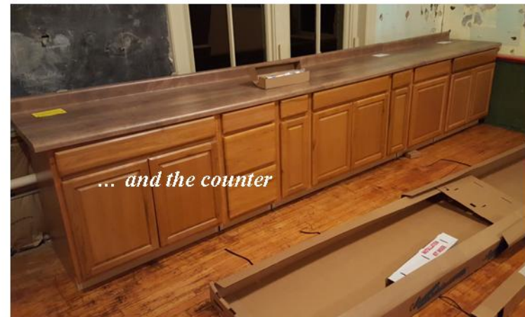
... and the counter