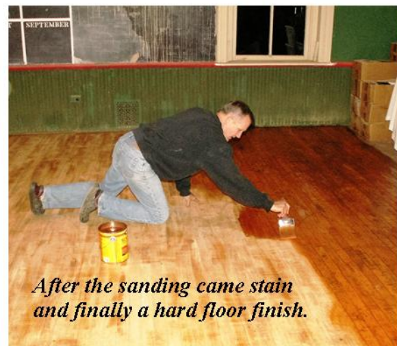
After the sanding came stain and finally a hard floor finish.