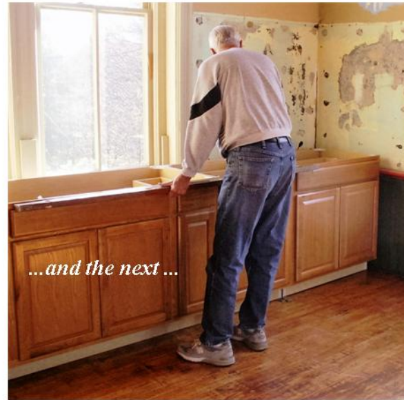
...and the next ...