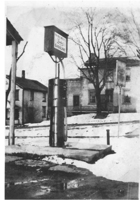
Gas pump in front of Shippy's on Mill Street in the early 1920s.