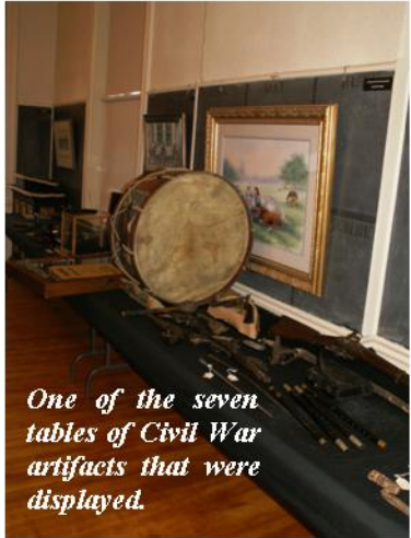
One of the seven tables of Civil War artifacts that were displayed.