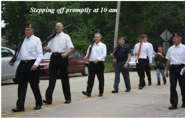
Stepping off promptly at 10 am