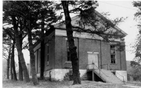
Former Community House