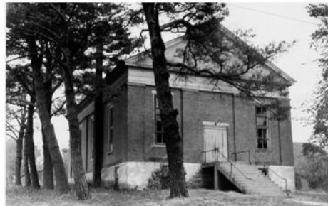
Undated photo of Community House