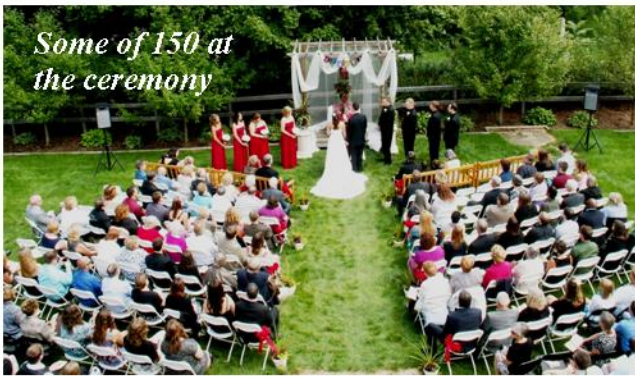
Some of 150 at the ceremony