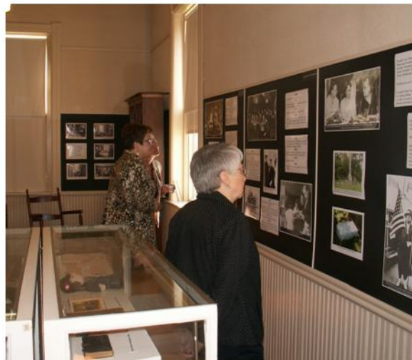
Above: A self-guided tour of the museum was the first order of business. These women are studying the photos of the life of Jane Addams. Below: Who can resist a buffet of delicious food?