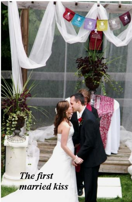
The first married kiss

150 join couple in museum wedding ceremony