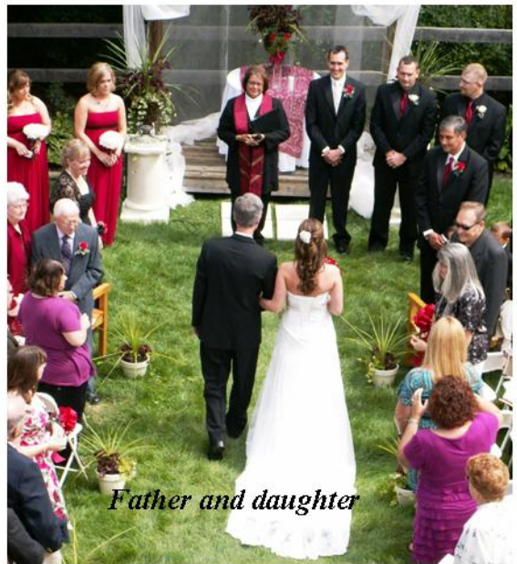
Father and daughter