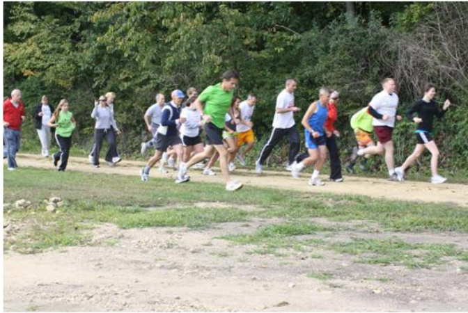
Off and running (walking) at 8th annual Jane Addams 5K