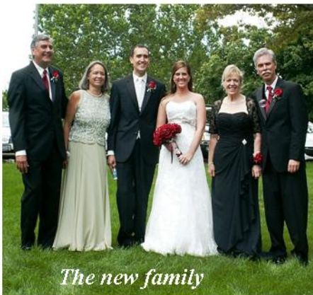
The new family