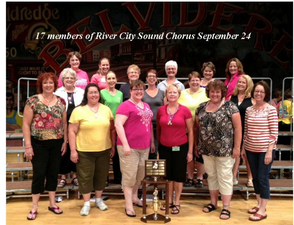
17 members of River City Sound Chorus September 24

Stable Blues; Original Dixie One Step; Oh, You Beautiful Doll; St. James Infirmary; Five Foot Two, Eyes of Blue; Lazy River; When the Saints Go Marching In; Ain't Misbehavin'; The Sheik of Araby; Do You Know What It Means to Miss New Orleans?; Just a Closer Walk with Thee.