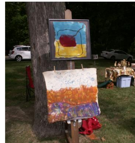
Kathy Wilken of Freeport specializes in abstract paintings using the wet felting process