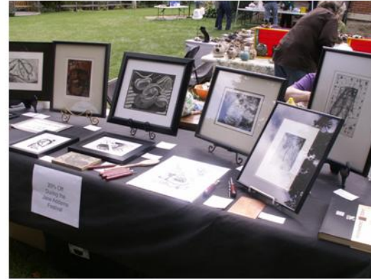
The prints and drawings offered by Ellen Bartels, Freeport, were outstanding and very reasonably priced.