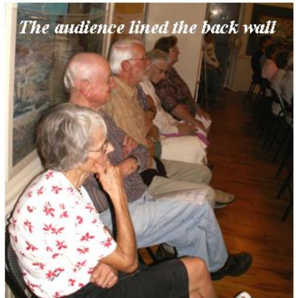
The audience lined the back wall