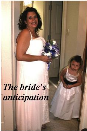
The bride's anticipation