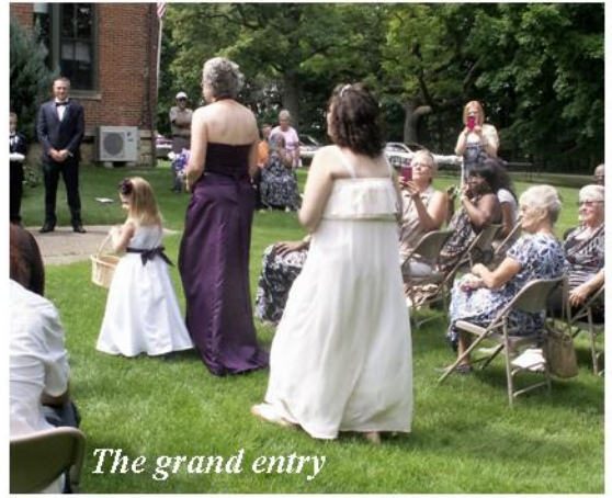
The grand entry