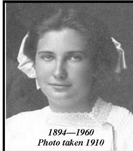
1894—1960 Photo taken 1910

Few are the knockers hanging around. And women who gossip are seldom found.