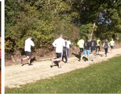
Runners sprint toward the finish line during the historical society's sponsored 2015 5K run on the Jane Addams Trail.