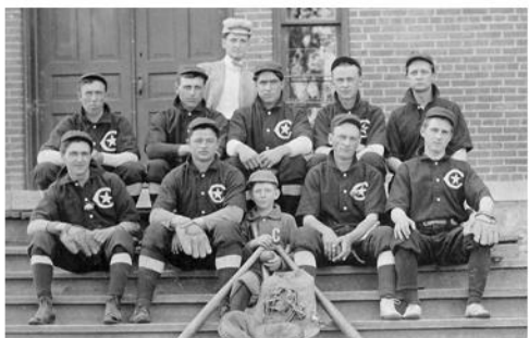
Are these the "Cedarville Stars"?