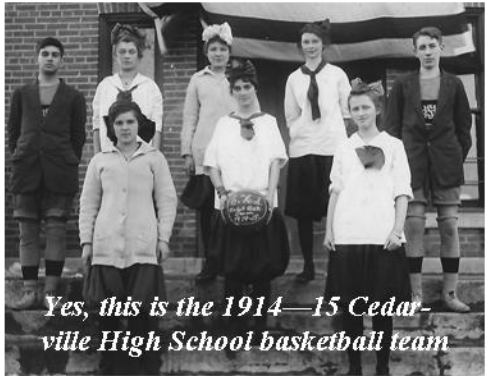
Yes, this is the 1914—15 Cedarville High School basketball team