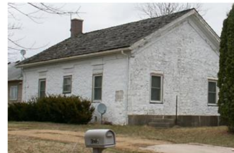
Buena Vista School 2009

items for the school, we sometimes had a basket social. The women and girls decorated baskets and put lunches for two people in them. When auctioned off, the men and boys would bid on them. The highest bidder got the basket of his choice and could eat with his favorite girl — he hoped. Sometimes the boys found